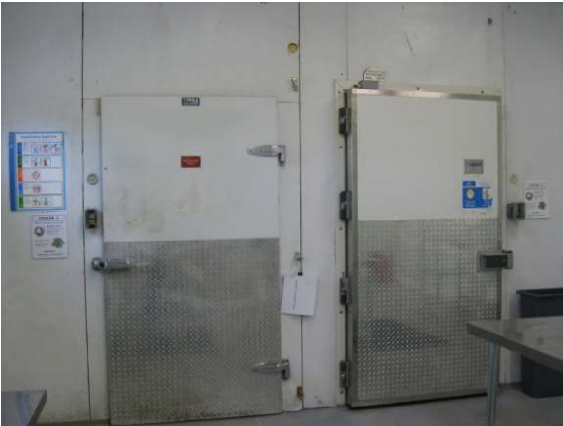
Installed two Walk-In Coolers at the Old Cotton Gin Building, Wired Boxes and Started $6,000